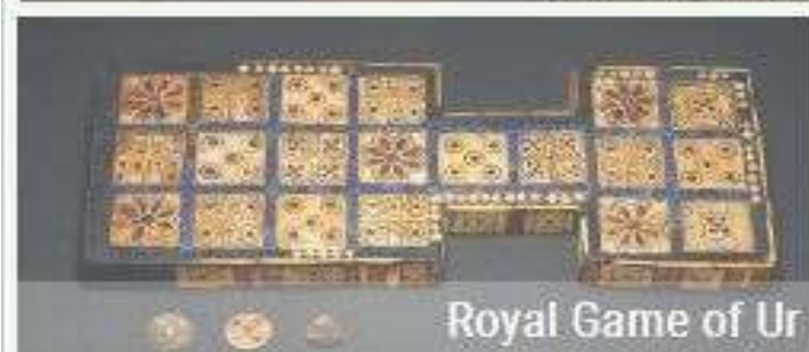
Royal Game of Ur