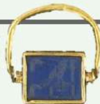
Gold Finger-Ring belonging to Tuthmosis III