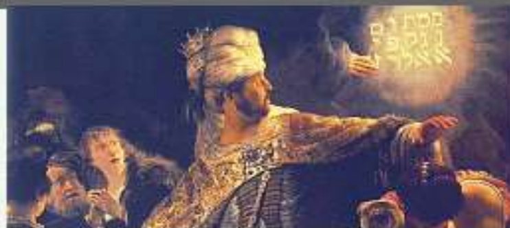
Belshazzar's Feast by Rembrandt