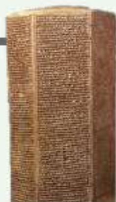
Taylor Prism Hexagonal clay prism, recording the campaigns of Sennacherib 691BC